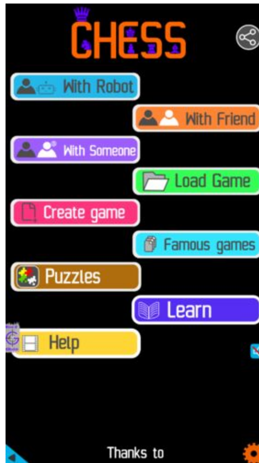
Figure 2: Play chess online for free. Solve puzzles and play with friends

Play chess for free at https://gbud.in/chs