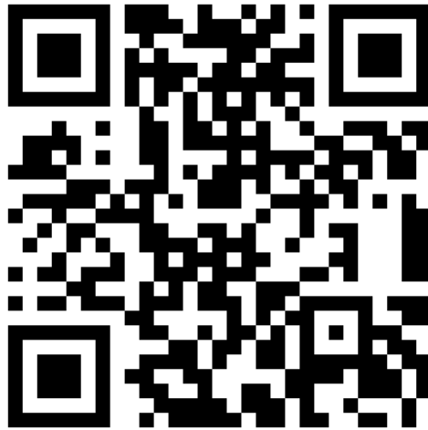
Figure 3: Solve these Save piece puzzles 1 to 10 puzzles online or view solutions by scanning this QR code or goto the link below